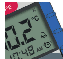
Count-down timer and alarms