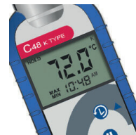
Max/Min feature recalls highest and lowest reading