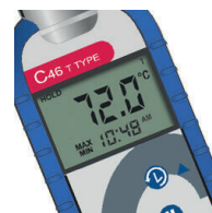
Max/Min feature recalls highest and lowest reading