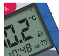
Count-down timer and alarms