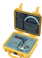
MDM50 Portable Hygrometer