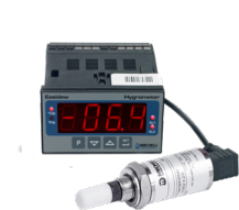
Easidew Online Dew-Point Hygrometer