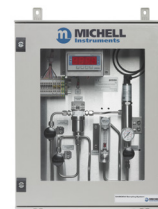
ES20 Compact Sampling System

Michell Instruments Ltd , Rotronic Instruments Corp. 135 Engineers Road, Suite 150, Hauppauge NY 11788 Tel: 631 427 3898, Email: us.info@michell.com , Web: www.michell.com/us