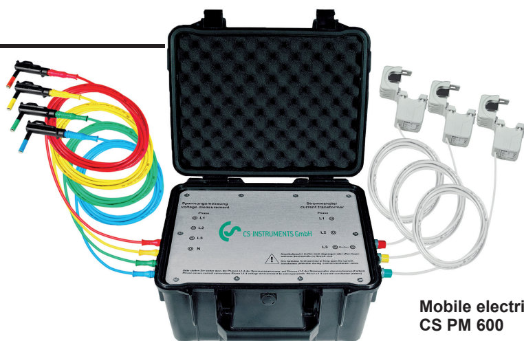
Mobile electricity/effective power meter CS PM 600