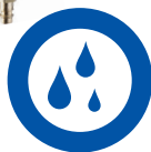
Pressure dew point